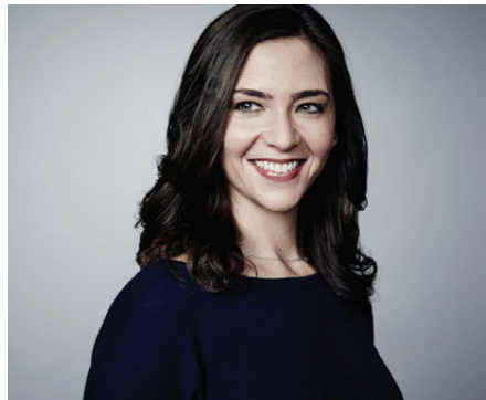
Emmy-winner Lizzie Kerner Fox '03 was tapped to serve as senior vice president of non-fiction programming for HBOMax which will begin streaming content in the spring of 2020.