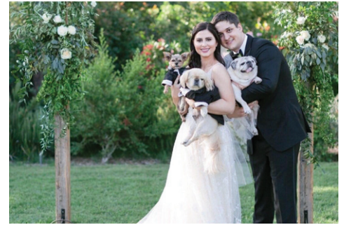
(clockwise starting from upper left)