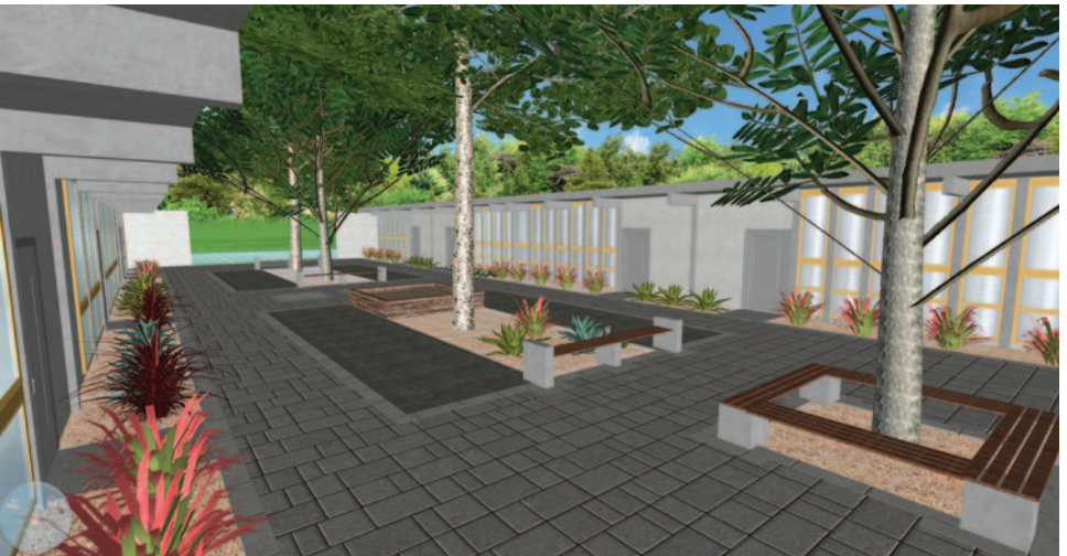
Rendering of newly-created Alumni Courtyard

Leave your mark on Campbell Hall by purchasing a courtyard stone.